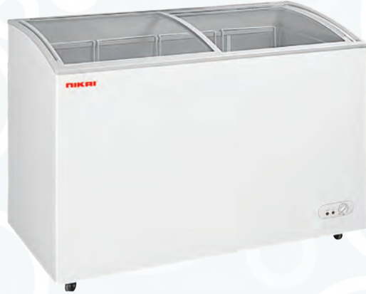
Sliding Curve Glass Door NCF390GL/ NCF400GL