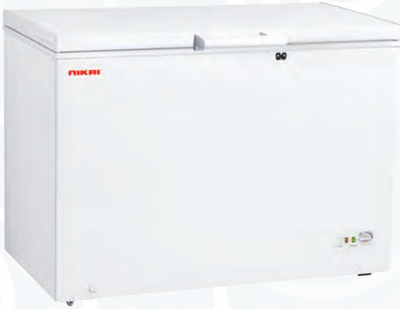
NCF440N6 - NCF340N5