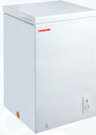
NCF260N5 - NCF150N7