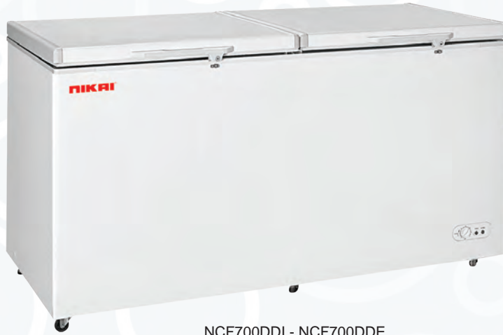
NCF700DDI - NCF700DDE