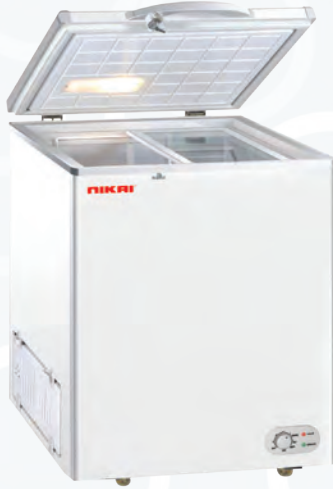
Sliding Flat Glass with Foamed Door NCF442N5EG - NCF262N5EG