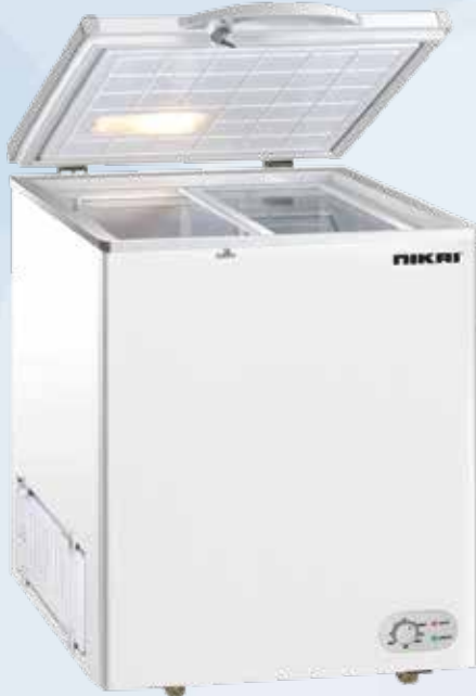
Sliding Flat Glass with Foamed Door NCF442N5EG - NCF262N5EG