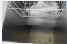
Stucco Embossed Aluminium Inner