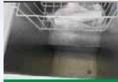
Stucco Embossed Aluminium Inner