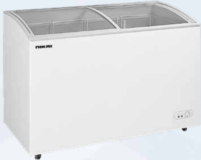
Sliding Curve Glass Door NCF380GL