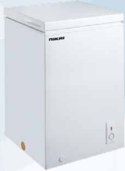
NCF150N5 - NCF260N5