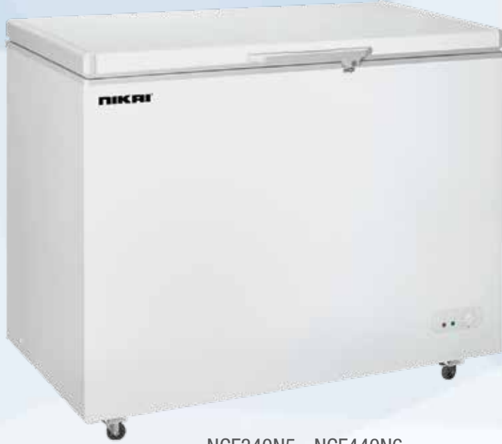
NCF340N5 - NCF440N6